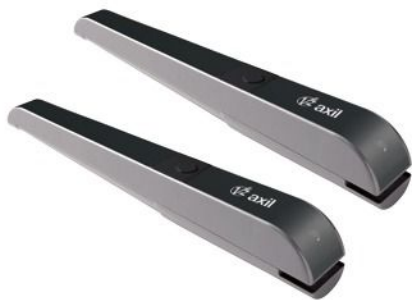
1 Irreversible electromechanical actuator