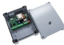
2 CITY1 Digital control unit for 230V motors