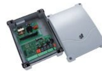
2 CITY2+L Digital control unit for 24V motors