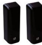
5 SENSIVA-XS Miniaturized wall-mounted and pillar-mounted photocells